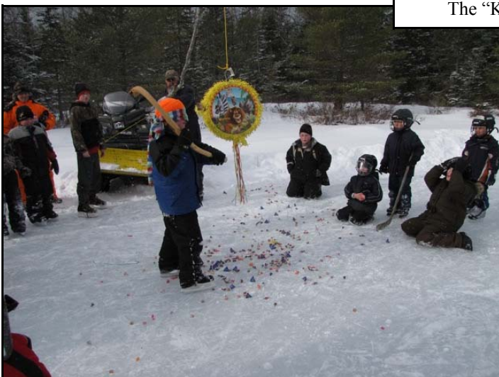
The "Koins for Kids" Lions Skate Party. Piñata and Hockey Fun.

You may call 1-888-2-DONATE (1-888-236-6283) to make an appointment or you can walk in.