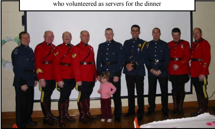
The Members of the Halifax Regional Police and the RCMP who volunteered as servers for the dinner