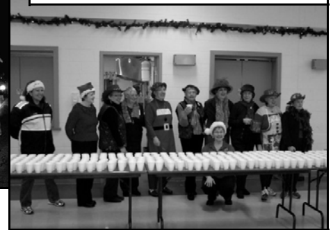
The Red Hatters prepare to serve hot chocolate after the Parade