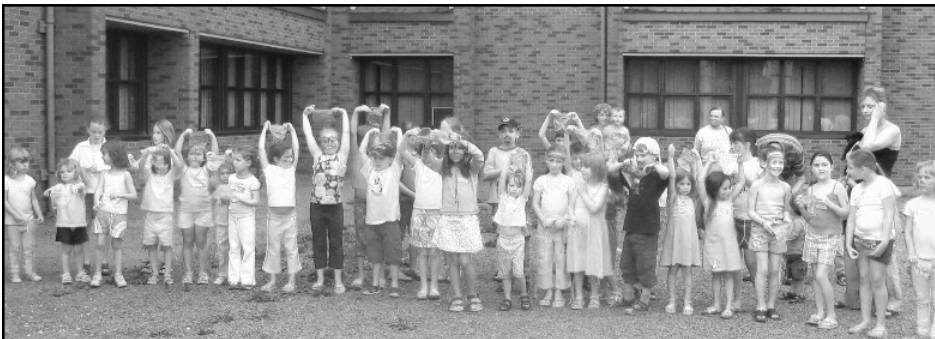
Monarch Rivendale Community Association held it's 1st Annual Community Barbecue Fundraiser on July 9th.

Many families attended , highlighting the need for a local park.