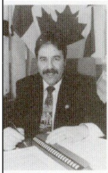
Peter Stoffer New Democrat Member of Parliament Sackville - Eastern Shore

Constituency Office 51 Cobequid Rd Lr Sackville, NS, B4C 2N1 Tel: (902) 865-2311 Toll-Free: 1-800-701-5557 Fax: (902) 865-4620 peter.stoffer@ns.sympatico.ca