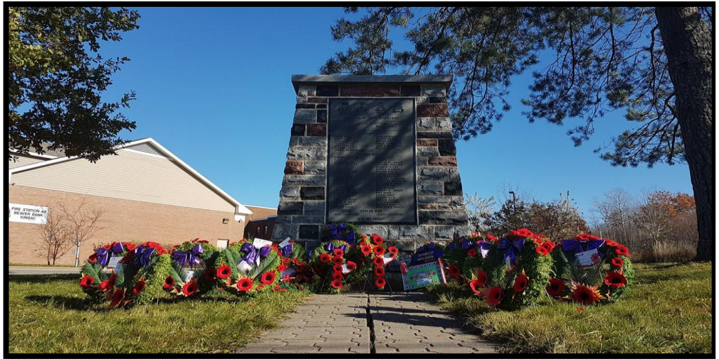
The Beaver Bank Kinsac Cenotaph after the 2017 Remembrance Day service.