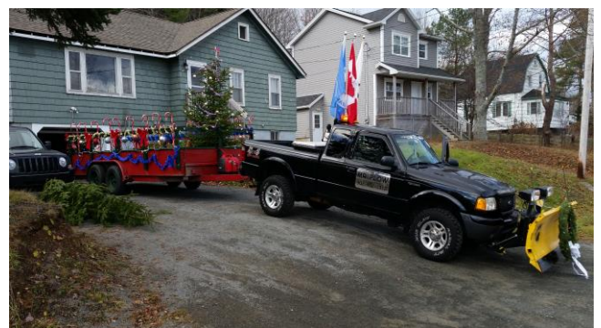
2nd Beaver Bank Scouting entered 3 highly decorated floats in this year's Parade of Lights.